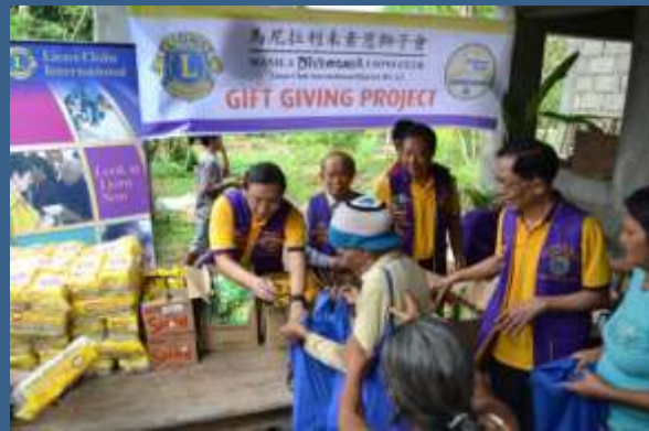
Distributing gifts to the needy, Manila Divisoria, Philippines

Learn more about the Measles & Rubella Initiative, a global partnership to stop measles & rubella at